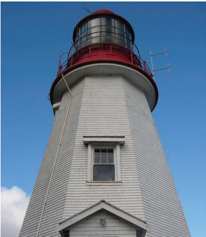
Pacific Rim National Park Reserve of Canada

Today, backpackers know the trail as the West Coast Trail and come to see the beauty, experience the challenges, and walk the path of those that came before them. However, this rugged hike is not for everyone.